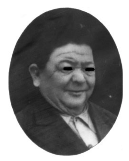
FIG. 2. Appearance of a 70 year old patient with GH deficiency due to a PROP1 mutation. Note absence of grey hair and loose skin. For details see text.