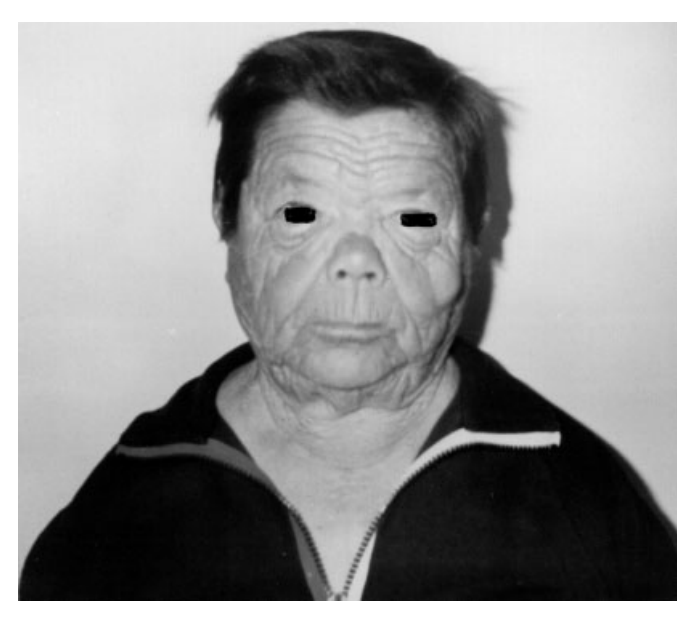
FIG. 1. Appearance of a 58 year old patient with GH deficiency due to a PROP1 gene mutation. Note wrinkled and loose skin.